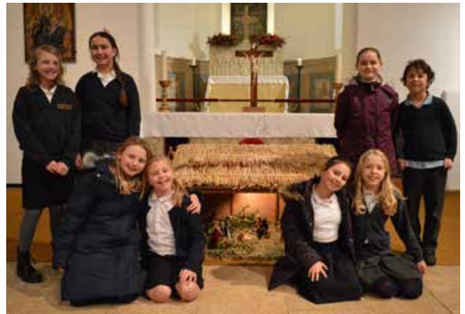
Singing Saints Children's Choir, Wednesdays at 4 pm

Our Junior Church, "Growing Saints" meets every third Sunday at 10.30am