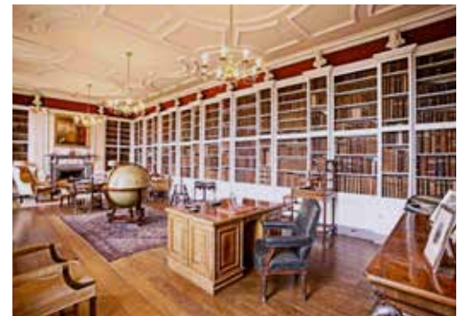
The library at Lamport Hall

The house was developed in various stages. Unfortunately, little remains of the original Tudor manor apart from a glimpse of its foundations which can be seen under the floorboards in the dining room. The central part of the existing house was designed in 1655 by John Webb, and the two wings were added in the eighteenth century by Smith of Warwick, who built a lot of country houses in this area. An extension at the back of the house, and the current gardens, were added in the nineteenth century.