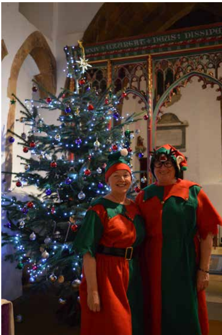
Christmas Tree Festival