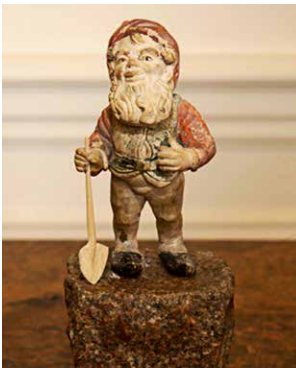
The famous gnomes were allegedly shot by Sir Charles' daughters. Only one survivor remains - he is the oldest garden gnome in the world.

Only one of these gnomes survives today. Allegedly, after Sir Charles' death, his daughters shot all the others out of resentment that he had spent more time with the gnomes than with them. The survivor is officially the oldest garden gnome in the world